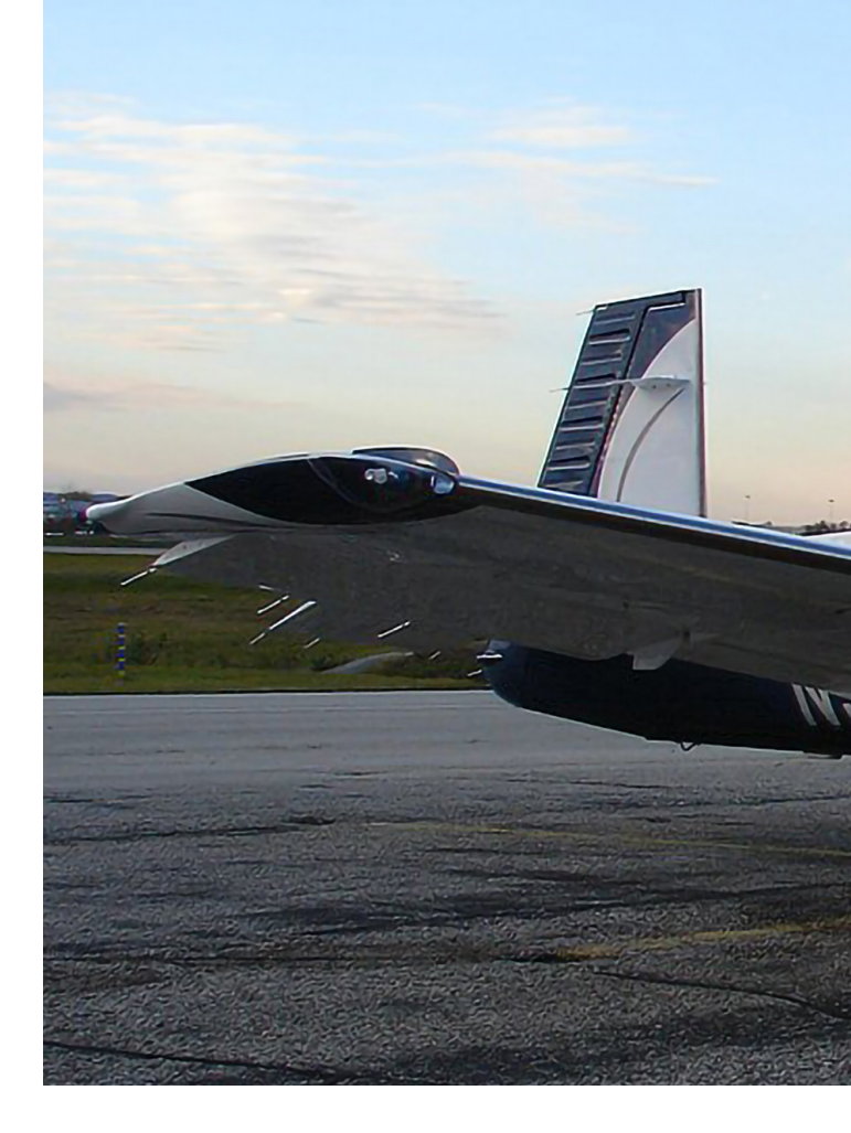
Big-engine M20s—this Ovation 2 is outfitted with a Continental IO-550 six-cylinder engine putting out 280-hp—combine airframe efficiency with much higher power and increased fuel capacity to create some exciting, go-fast/fly-high machines.

Prior to 1967, when electrical actuation of the landing gear became an option, pilots used a beefy lever between the front seats to put the wheels up and down, a perfectly reliable process as long as the